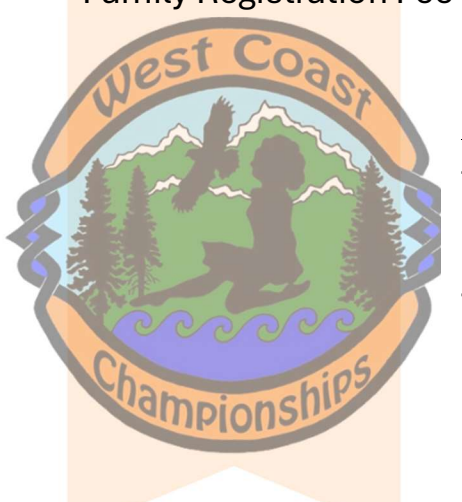
Figure Dancing $4 per competitor, per team Family Registration Fee $45 per immediate family

Family Maximum: $150 per immediate family, excluding family registration fee, late fees (when applicable), and specials (Charity Light Jig Special, Treble Reel Special, Slip Jig Special, Hornpipe Special and Traditional Set Specials).