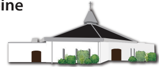
Teach Pobail Naomh Cróine