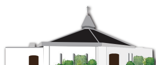
Teach Pobail Naomh Cróine